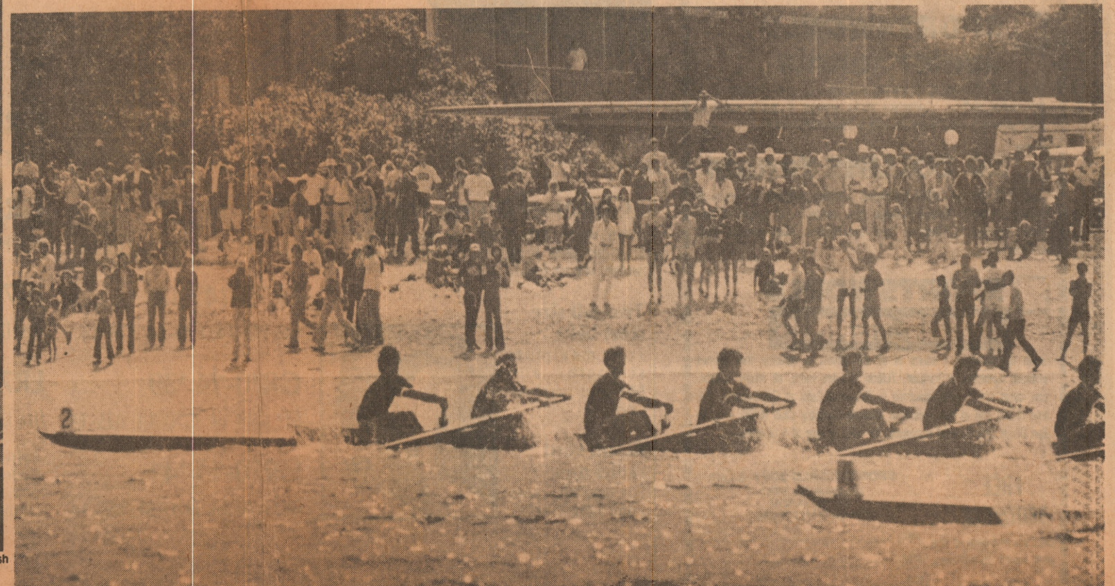
varsity eight heat in 6:27.3 and placed fifth in the finals. Coupled with a fourth in the junior varsity eights, it was Navy's top Crew Classic performance.