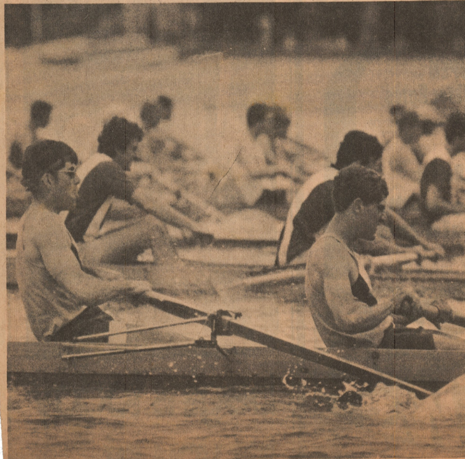
The strain on muscles and oars is shown by M.I.T.'s varsity eight as it strains for speed in the varsity eight consolation race won by UCLA.